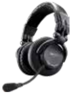
HP-2 Dual-Side Headset