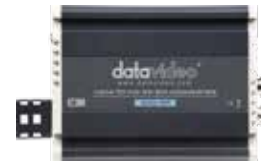
DAC-9P HDMI to SDI