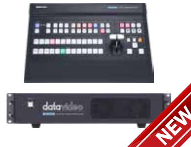
SE-3200 12 Input HD Switcher