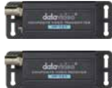
VP-737 Composite Signal Repeater