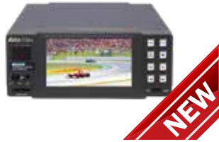
HDR-80 ProRes Video Recorder Desktop