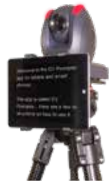
TP-150 Teleprompter system dedicated to PTZ cameras