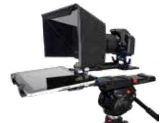
TP-500 DSLR Prompter