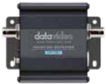
VP-781 HD/SD-SDI and Intercom Repeater Box