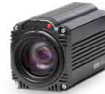
BC-50 1080P Camera with Streaming Encoder