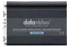
DAC-80 Audio Isolation Transformer