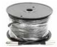
CB-4 50m 5-Pin Intercom Cable