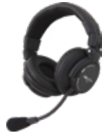
HP-2A Dual-Side Headset with 3.5mm Jack