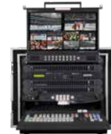
MS-2850 8 to 12 Input Flyaway Studio