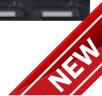
HDR-90 ProRes Video Recorder 1U Rackmountable