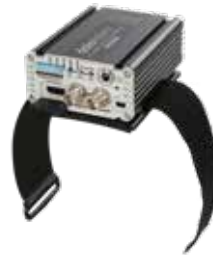
MB-5 DAC Series Tripod Mount