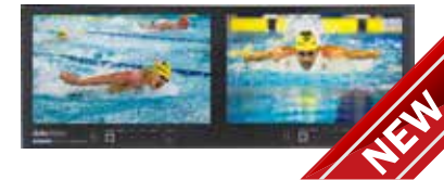
TLM-102 Dual 10" Monitor