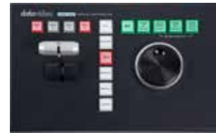
RMC-400 Replay Controller