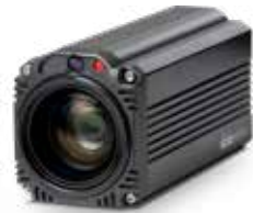
BC-200 4K Camera