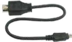
CA-64 IEEE 1394 4-Pin to 6-Pin Adapter