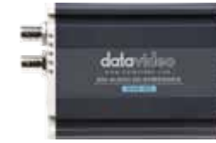
DAC-90 SDI Audio De-embedder