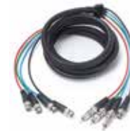
CB-10 HD YUV Cable-3m