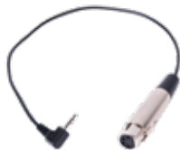
CB-8 3.5mm Jack to XLR Adapter