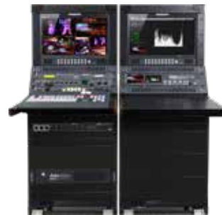
OBV-2850 8 to 12 Input OB Van Studio