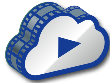
DVS-200 Streaming Server in the Cloud