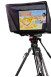
LBK-1 Look Back Kit