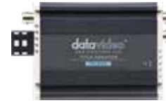
TC-200 SDI Title Creator