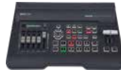
SE-650 4 Input HD Switcher