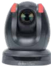
PTC-200 4K Camera