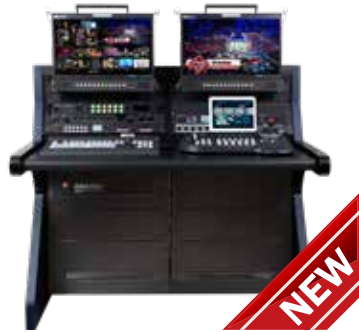
OBV-3200 12 Input HD OB Van Studio