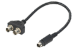
CB-2 S-Video to Dual BNC Cable