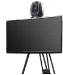
LBK-2 Look Back Kit for Monitor