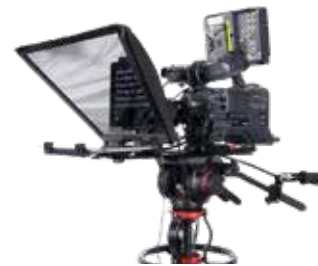
TP-650 Large Screen Prompter Kit for ENG Cameras