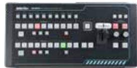
RMC-260 SE-1200MU Remote Controller