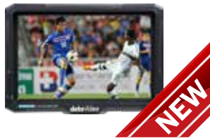
TLM-700K 7" 4K Monitor