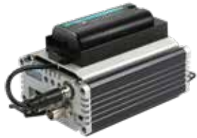
MB-4 DAC Series Battery Holder