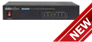
DAC-45 4K Up Down Cross