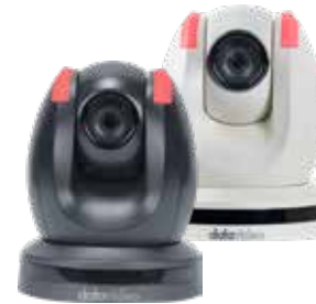
PTC-150T 1080P HDBaseT Camera