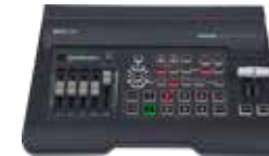
SE-500HD 4 Input Mixed Resolution Switcher