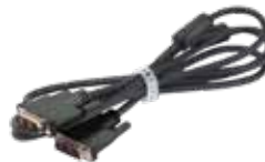
CB-9 DVI Cable