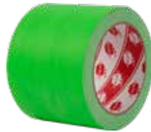
TA-2 Green Color Tape 96mm x 25M