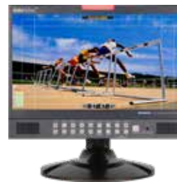
TLM-170P/PM/PR 17.3" HD/SD Monitor