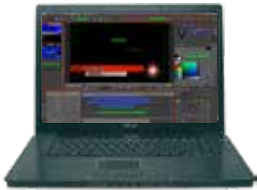
CG-500 HD/SD Graphic & Character Generator