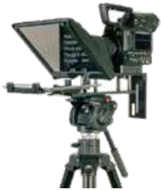
TP-300 Tablet Prompter