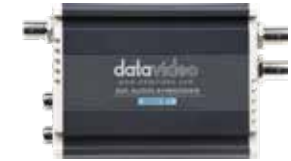
DAC-91 SDI Audio Embedder