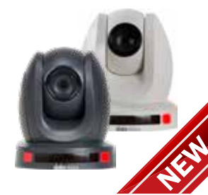
PTC-140T 1080P HDBaseT Camera