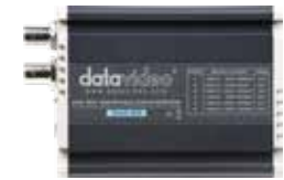
DAC-60 SDI to VGA