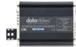
DAC-8P SDI to HDMI