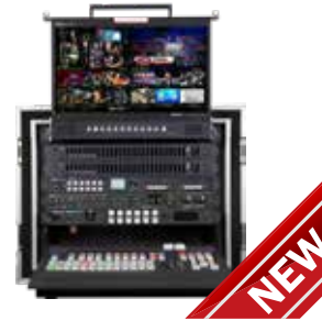
MS-3200 12 Input Flyaway Studio