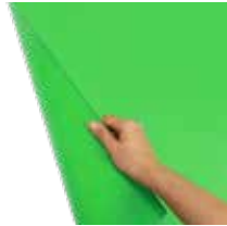
MAT-5 Green Color Plastic Mat 1.8M x 54M Wall use