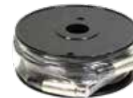
CB-3 20m 5-Pin Intercom Cable