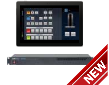
SE-500MU 4 Input Mixed Resolution Switcher