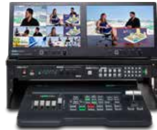
GO 650 Studio 4 Input HD Studio