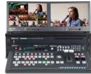
GO 1200 Studio 6 Input HD Studio