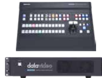
SE-2850 8 to 12 Input HD/SD Switcher