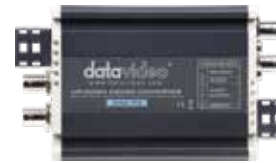
DAC-70 Up Down Cross