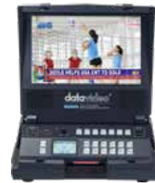
HRS-30 Fieldside Hand Carry Recorder