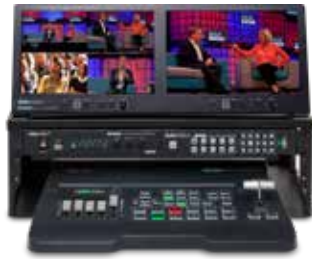
GO 500 Studio 4 Input Mixed Resolution Studio