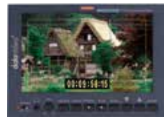
TLM-700HD 7" HD/SD Monitor