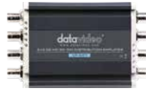
VP-597 2x6 3G-SDI Splitter