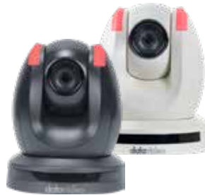
PTC-150 1080P Camera