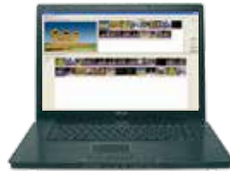
CG-350 HD/SD Character Generator Software