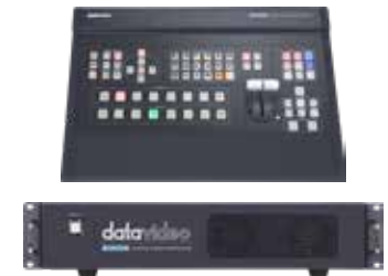
SE-2200 6 Input HD/SD Switcher