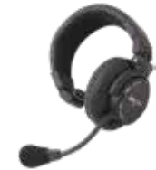
HP-1 Single-Side Headset