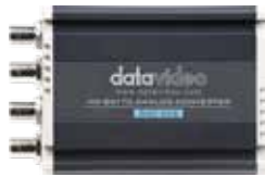
DAC-50S HD-SDI to Analogue