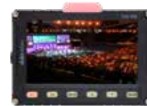
TLM-430 4.3" Look-Back Monitor