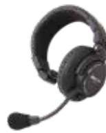
HP-3 Single-side Headset with XLR Connector