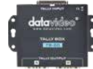
TB-20 Tally Box Converter for Panasonic Switcher