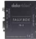
TB-5 Tally Box Converter