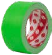
TA-1 Green Color Tape 48mm x 25M