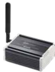
DVP-100 DV Prompter Pro Wireless Prompting System