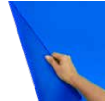
MAT-7 Blue Color Plastic Mat 1.8M x 54M Wall use