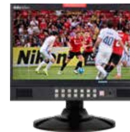
TLM-170L/LM/LR 17.3" HD/SD Monitor