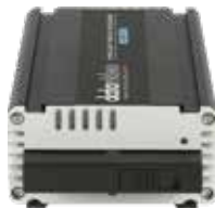
HDR-10 Instant Replay