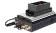
MB-6 VS-100 Battery Mount Kit