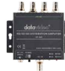
VP-445 1x4 HD-SDI Splitter