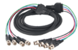
CB-14 YUV 4*BNC-4BNC Cable