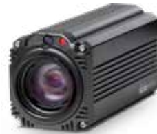
BC-80 1080P Camera