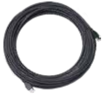
1066 IEEE1394 DV Cable-10m