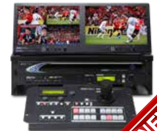
GO KMU-100 Studio Virtual multicam studio