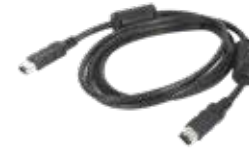
DVM2266 1.8m 6-Pin to 6-Pin DV Cable