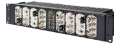
RMK-2 2U Rackmount Kit for DAC