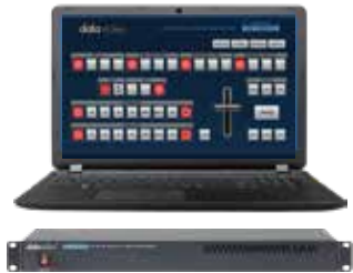
SE-1200MU 6 Input HD Switcher