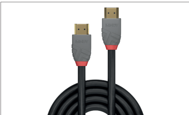
Cable front view

This product is available in these lengths: 36960 – 0.3m (0.98ft), 36961 – 0.5m (1.64ft), 36962 – 1m (3.28ft), 36963 – 2m (6.56ft), 36964 – 3m (9.84ft), 36965 – 5m (16.44ft)