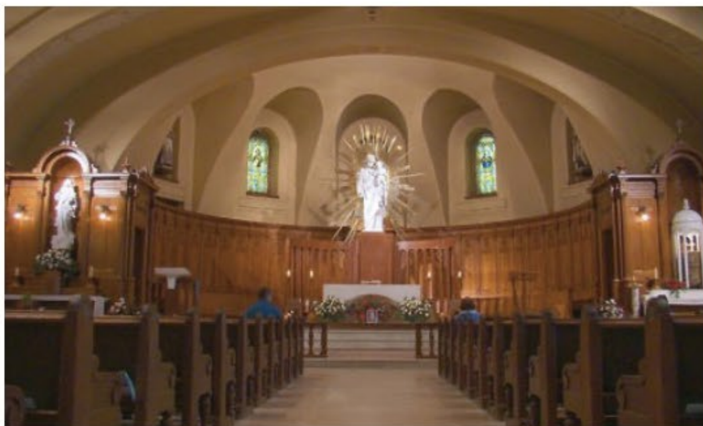
House of Worship